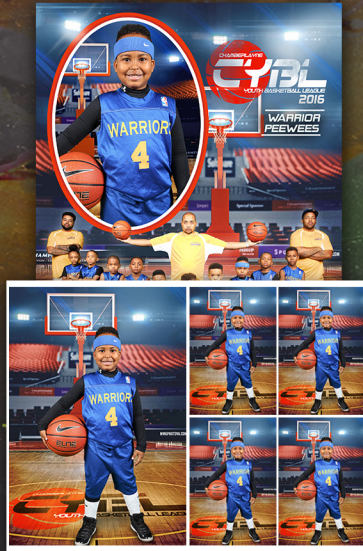
Package B 2 - Sheets